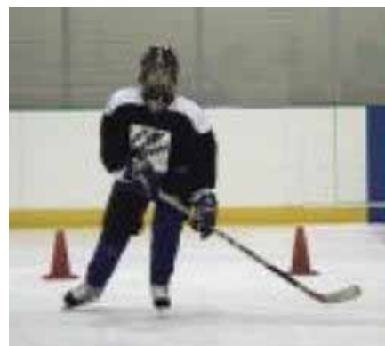
Forward stride extension

I personally feel that skating is the cornerstone of a good hockey player, and although one understands that not all players will become the next NHL prospect, as coaches we need to provide quality skating skills opportunities in our programs.