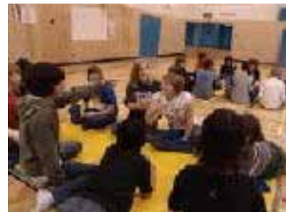
Students playing Hand Games

If you would like to know what your child is doing in Physical Education please see check out our website.